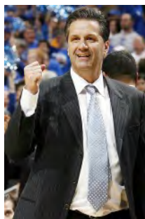
John Calipari Lexington, KY Head Coach, Kentucky Wildcats Men's Basketball "Players First" Friday, 10:25 am